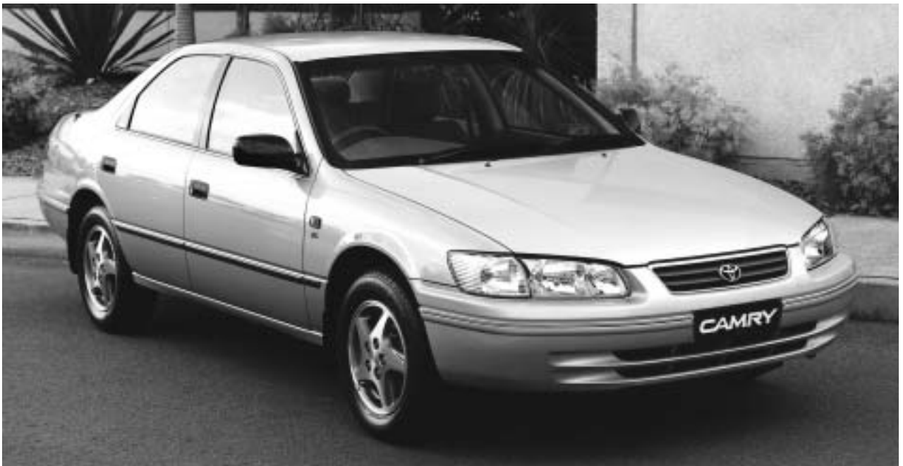
Toyota Camry 4 door sedan