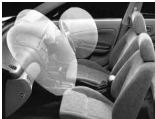
Airbags greatly reduce the threat of injury in a crash.

The chief safety feature of any vehicle is the driver. Avoiding a crash in the first place is far preferable to relying on the inbuilt safety features of your vehicle.