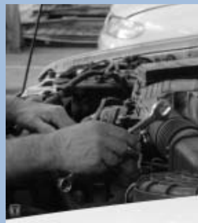
Perry's A-grade service is available throughout metropolitan Brisbane.

To make an appointment or find out more about the service, call QFleet's South Brisbane Workshop on 3405 6856.