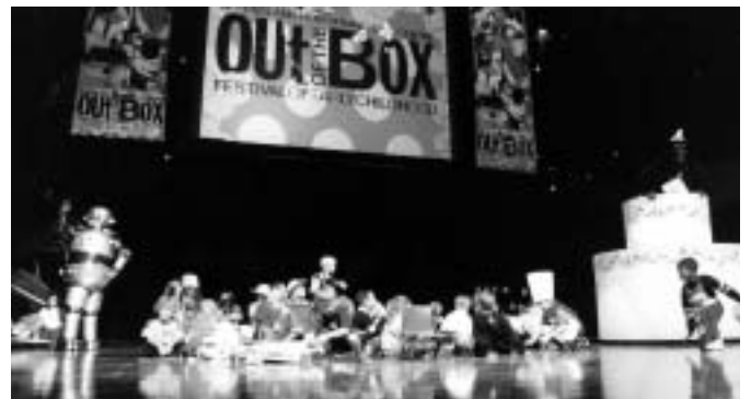
Children join some of their favourite Out of the Box entertainers on stage.

"QFleet is proud to sponsor an event that helps give children a new perspective on their community and their own creativity."