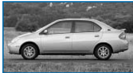
The Prius incorporates several energy saving features.

To order a Prius as your next leased vehicle, talk to your Fleet Consultant.