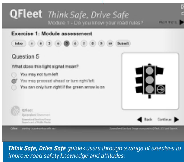
Think Safe, Drive Safe guides users through a range of exercises to improve road safety knowledge and attitudes.

Think Safe, Drive Safe is available from the Goprint Bookshop, 371 Vulture St, Woolloongabba. To order the program, phone Goprint's call centre on 07 3246 3399, or 1800 679 778 (callers outside Brisbane only).